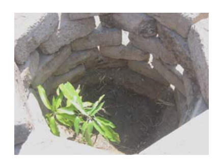
A beneficiary's mango tree is planted within the grounds of her house. The circular wall protects the tree from goats.

With regard to beneficiaries there are plans to facilitate economic strengthening of households through the provision of mango trees. Whilst some OVC have received trees, this initiative will be expanded to include more children. The expectation is that the trees will eventually produce enough fruit for children to be able to sell at a profit.